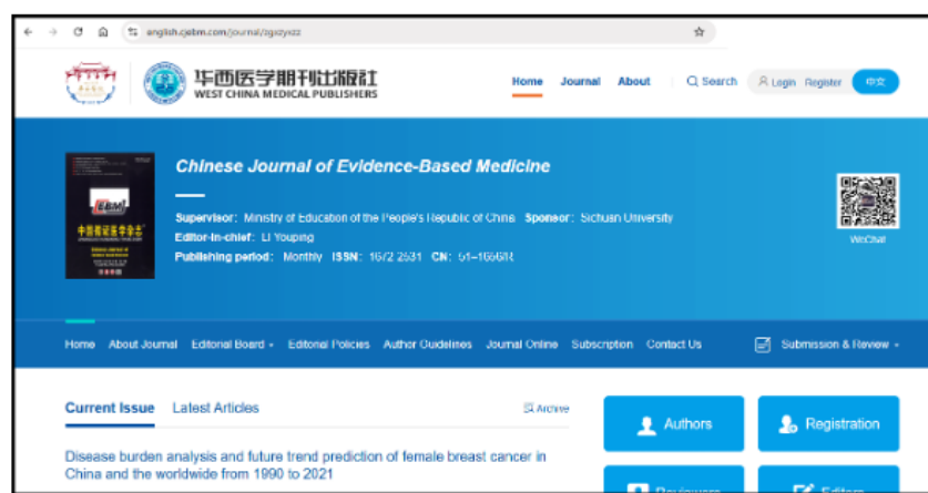
Fig. 1a: Authentic journal