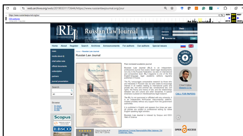
Fig. 2a: Authentic journal (2019) (Source: https://web.archive.org/web/20190331173644/https://www.russianlawjournal.org/jour )