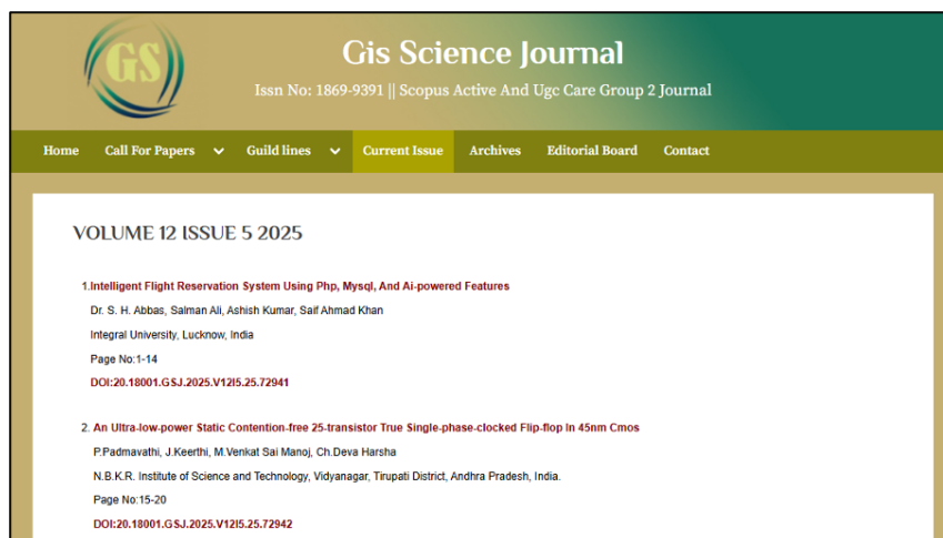
Fig. 3: Hijacked journal

Some hijacked journals provide fake editorial boards or copy them from other journals. They may also present fabricated journal metrics and incorrect impact factor values (Dadkhah et al., 2016) and claim indexation in different bibliographic databases, such as Scopus or Web of Science.