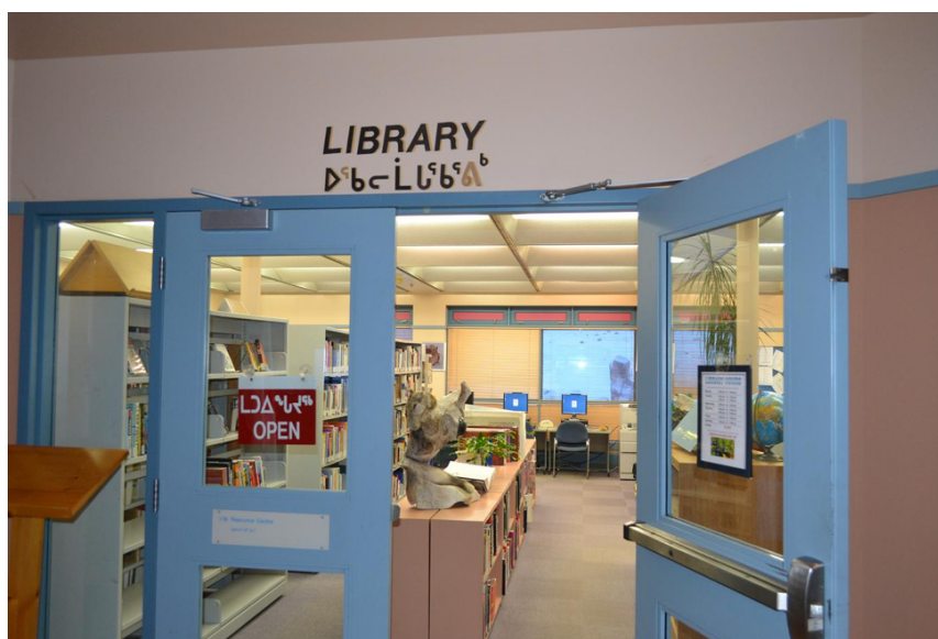
Figure 2: Indigenous Language Signage

the entrance (see Figure 2 below). By offering this support, this college is playing a major role in literacy in Nunavut, even if there are no universities present in this region.